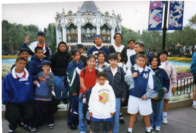
One of the trademarks of the North San Mateo Curia is ensuring that its young Legionaries have an enjoyable time every once is a while. Here we took them to Great America in the early 90's.

1997 – Business as Usual. There was anxiety in the air in 1997 as China was about to take over Hong Kong from British rule. A question of religious freedom for Catholics in this tiny island lured over. Of course, for the Legion of Mary, this event thousands of miles away had some implication for us. What if China suppresses Catholicism? While this monumental event was unfolding, there was a cursory look being taken by some of us,